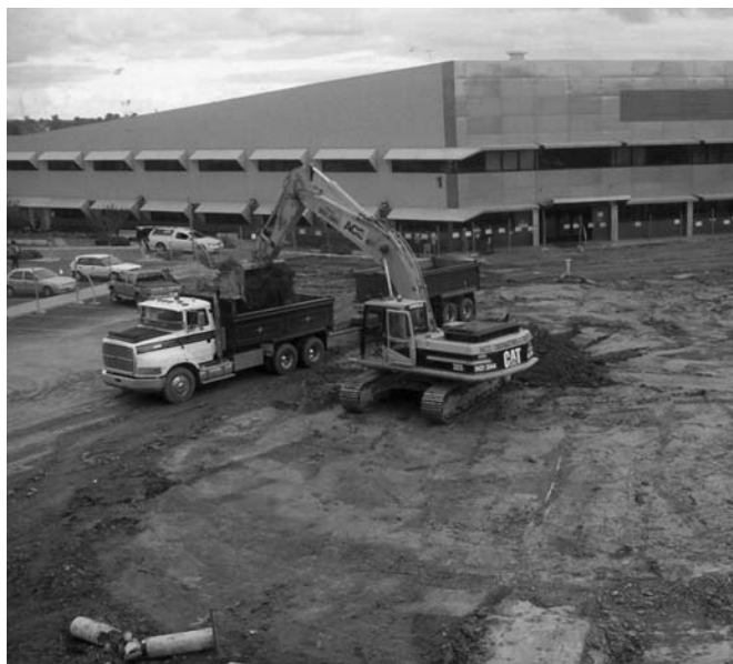
Work takes place on the site of the new student Cafeteria outside Building 1 at Waverley Campus

Building works at Waverley Campus are now well underway. The Institute has been granted $9.96 million to construct new teaching facilities and student cafeteria at the Waverley Campus. The grant is being jointly funded by state and federal governments.