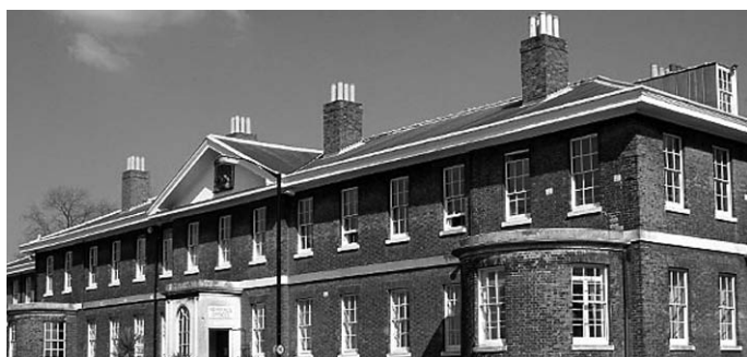
Sample of heritage building

The need for heritage trade skills is linked to the restoration and conservation of commercial and public buildings, with some additional demand at the higher end of the domestic housing restoration market, and also the restoration of other heritage items (eg household fittings, furniture, boats).