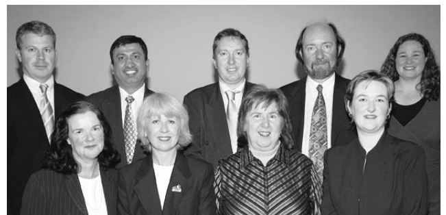
Holmesglen staff graduates

Holmesglen is an approved provider of the University accredited Graduate Certificate. It is a product of a joint venture of three academic bodies - the Charles Sturt University (CSU), TAFE NSW and the Canberra Institute of Technology. A consortium known as the Australian Graduate Management Consortium (AGMC) is charged with running the day-to-day operation of the program.